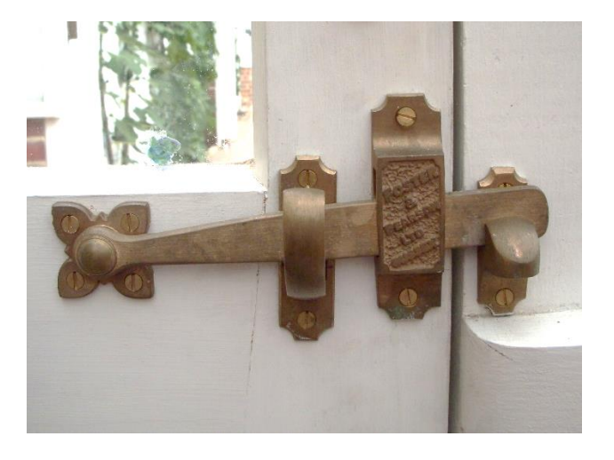
Above: The Trademark Foster & Pearson latch