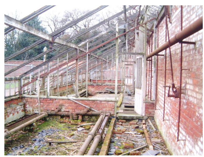
Above: Before and Below: After restoration