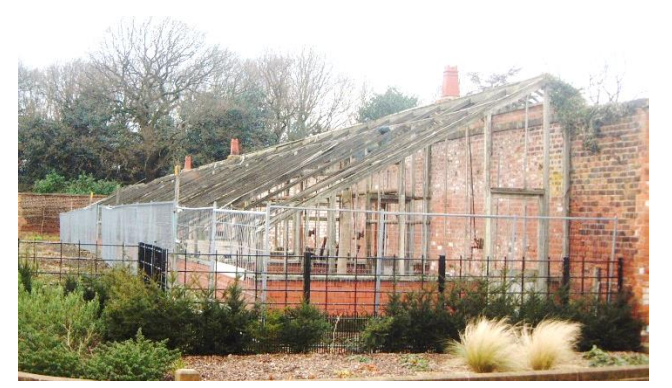
Above: Before and Below: After restoration

The original paint was highly toxic, and so can no longer be used, but hence it preserved the timber well. Linseed oil was therefore sourced