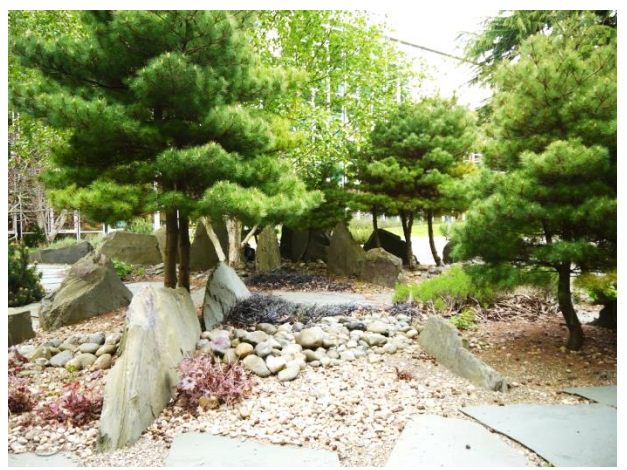
Detail of rock garden

<sup>4</sup> <u>https://en.wikipedia.org/wiki/Broughton_baronets</u>: