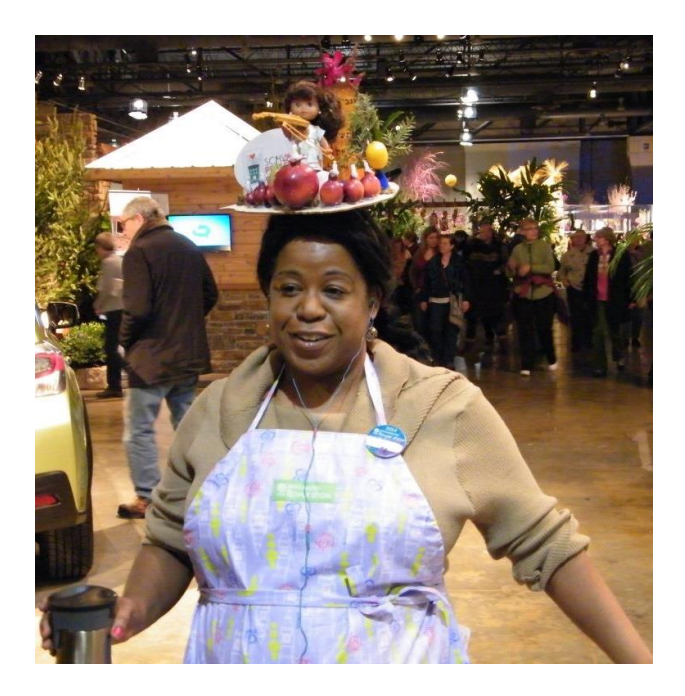
Above and below: the Philadelphia show is vibrant and unusual

in deprived areas and other initiatives. Economic impact is estimated at $61million.