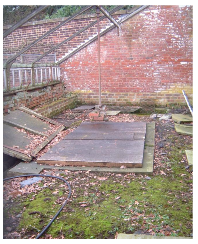
Above: Before and Below: After restoration

Congratulations to all involved for their concerted hard work in achieving this. Long may Grappenhall Heys continue to use and enjoy its glasshouses.