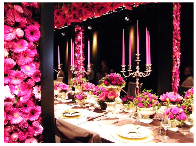
Outdoor dining in style à la Suisse Keukenhof promotes Dutch floriculture and horticulture on a massive scale: 800,000 visitors have their eyes "blasted with colour" ( see below ). They are moved around the site with Disney quality crowd management.

Zurich Giardina (indoors) is a very upmarket showcase for designers and contractors: 60,000 almost exclusively Swiss visitors in five days mid-March enjoy a themed approach – "live in your garden" being suitably vague.